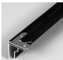
Pick a frame bottom