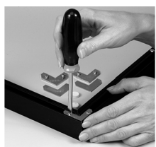
Attach the sides

Important Note: Do NOT fully tighten any screws until Step Three when frame is completed.