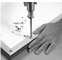
Secure with spring clips