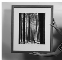
Display your art!