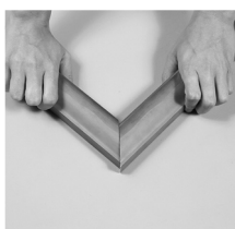
Spread the glue